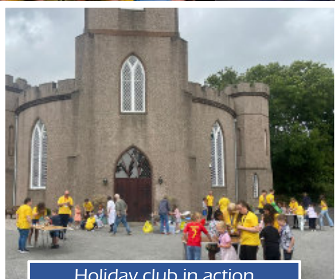
Holiday club in action

We run a HOLIDAY CLUB each August which is attended by around 70 children of primary school age. We usually use Scripture Union's material, and have a team of over 30 volunteers, roughly fifty percent of whom are regular members of our youth groups (Fuse, Impact, Ignite).