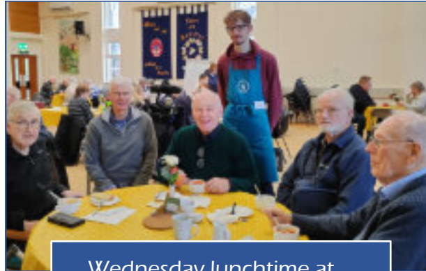
Wednesday lunchtime at Fetteresso's Community Cafe

A WEEKLY PRAYER MEETING is held each Monday afternoon during term-time, and all are welcome. There is also a PAINT AND PRAY group which meets each Tuesday, combining the pleasure of painting with the joy of shared prayer.