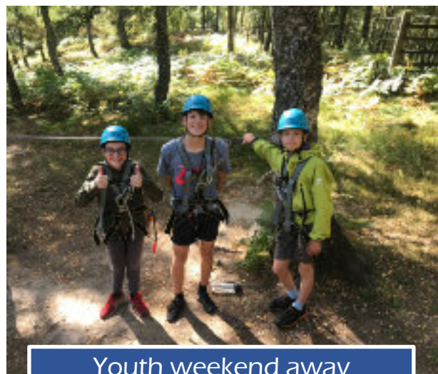
Youth weekend away